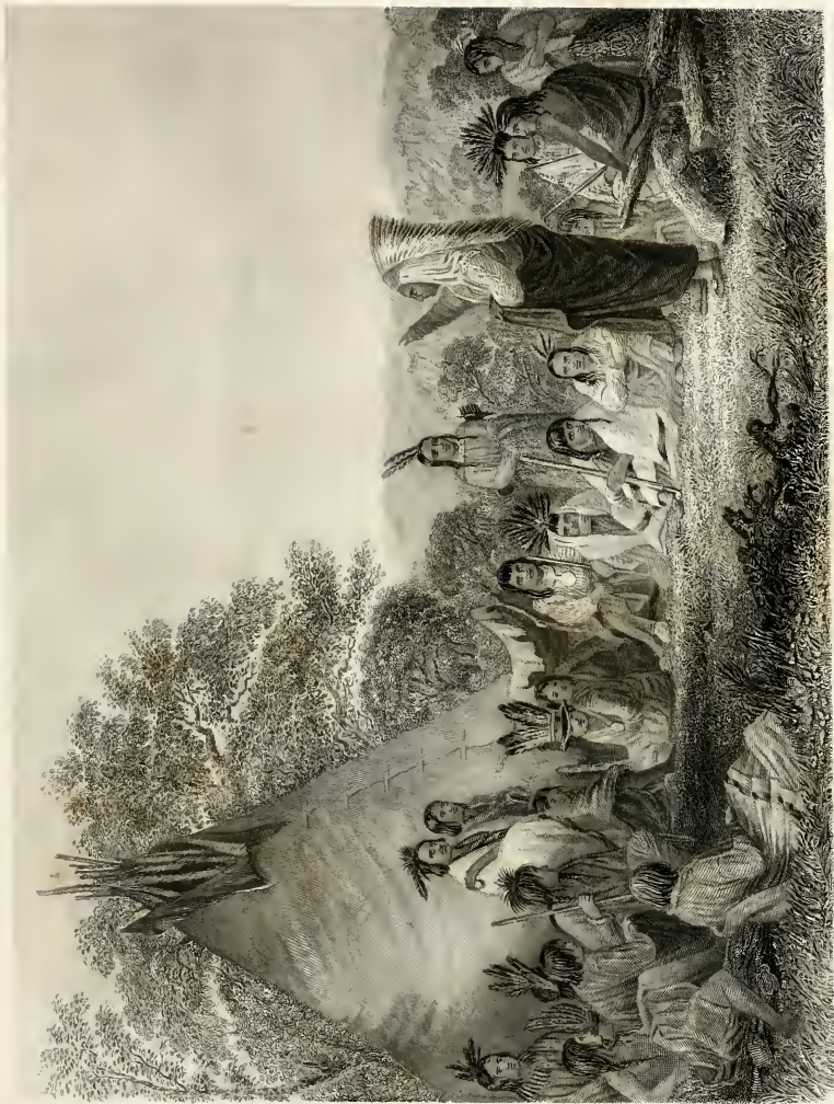
INDIAN VILLAGE IN THE MOUNTAINS